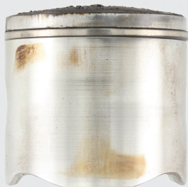
SABER Professional @ 100:1