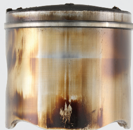
ECHO Power Blend @ 50:1