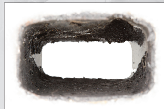
SABER Professional @ 100:1 4% Airflow Loss